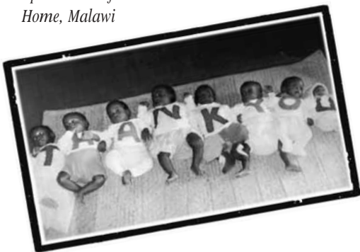
Open Arms Infant Home, Malawi